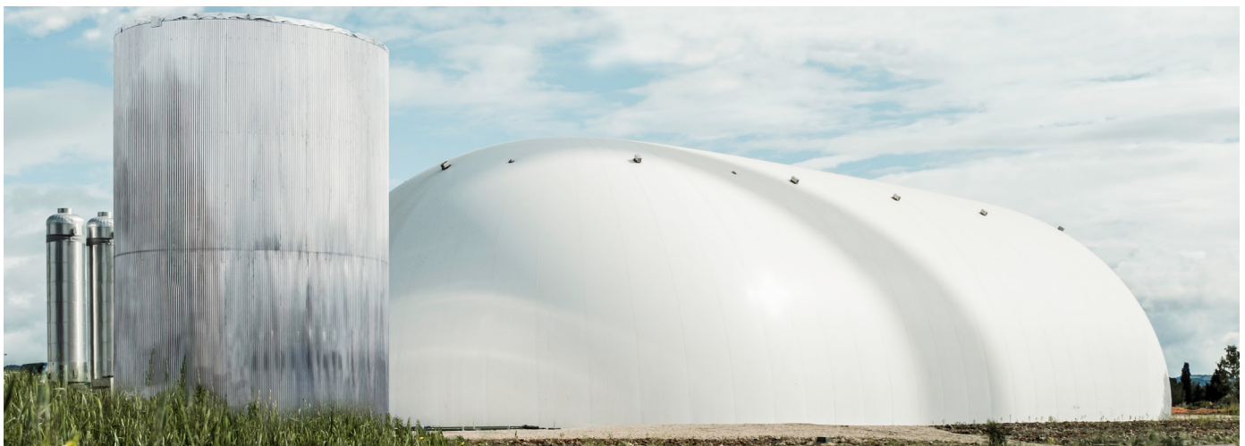
Energy Dome's CO 2 battery located in Sardinia, Italy.

The town of Pacific is an ideal location for an energy storage system due to the availability of existing electric grid infrastructure. The project, part of a multiphase site redevelopment effort, will increase energy reliability and resilience while delivering incredible value to customers. Construction is expected to get underway in 2026 and we expect the energy storage system to be operational by the end of 2027.