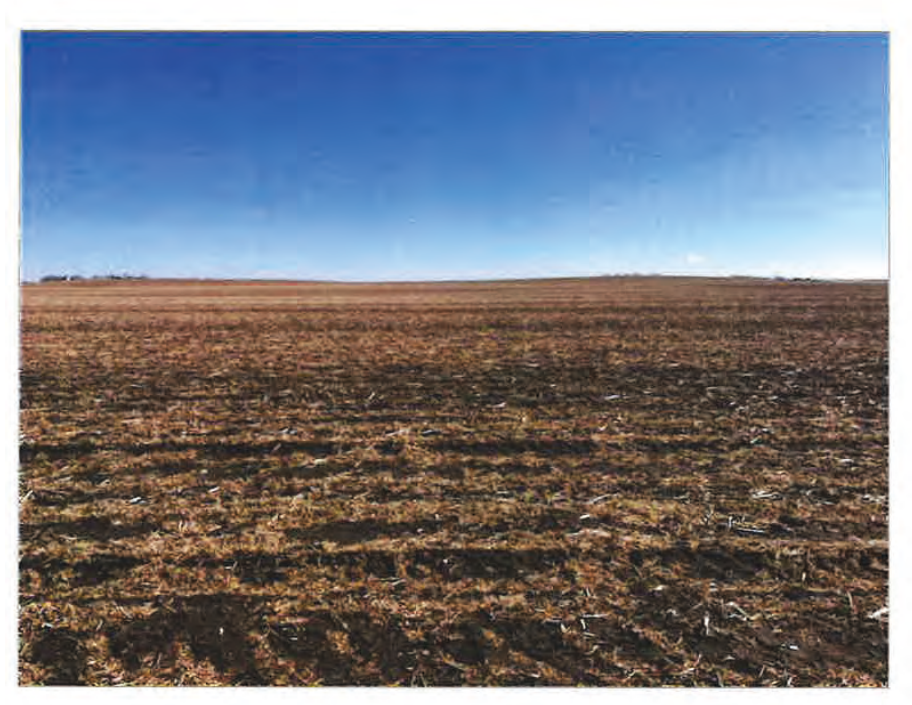
Figure 2: Overview of the northwest Project Area, facing east.