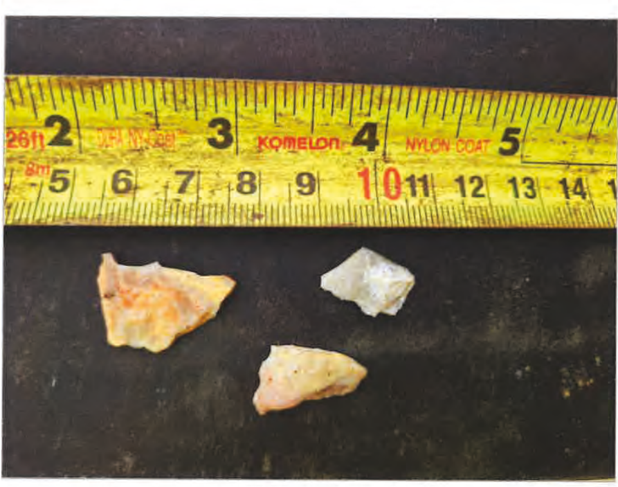
Figure 14: Flakes, Site BT-PRE-01.