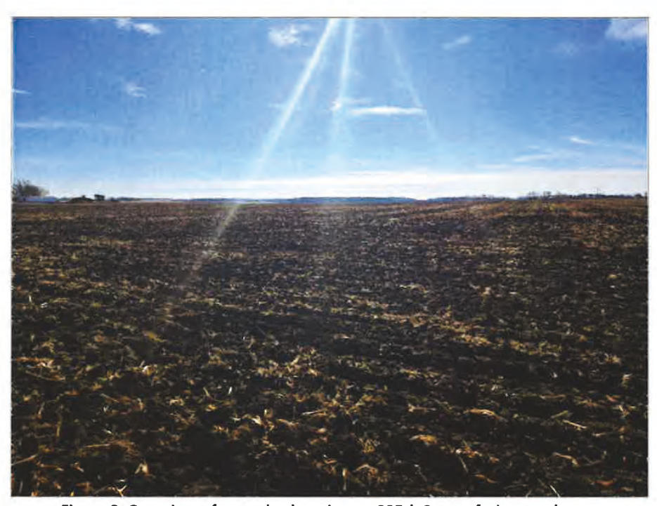
Figure 8: Overview of central substation on 325th Street, facing southeast.