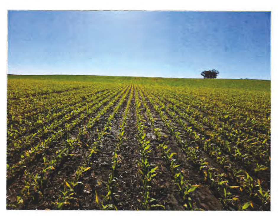
Figure 5: Overview of the southeast Project Area, facing east.