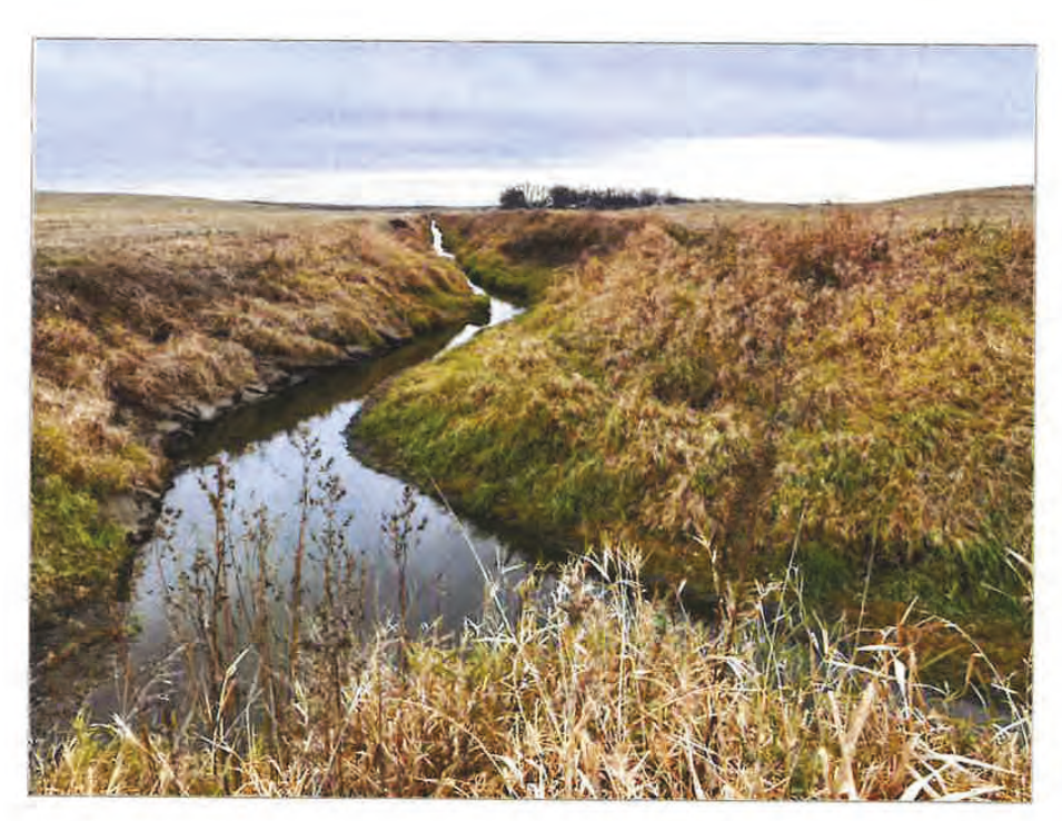
Figure 10: Overview of the east Project Area, facing north.