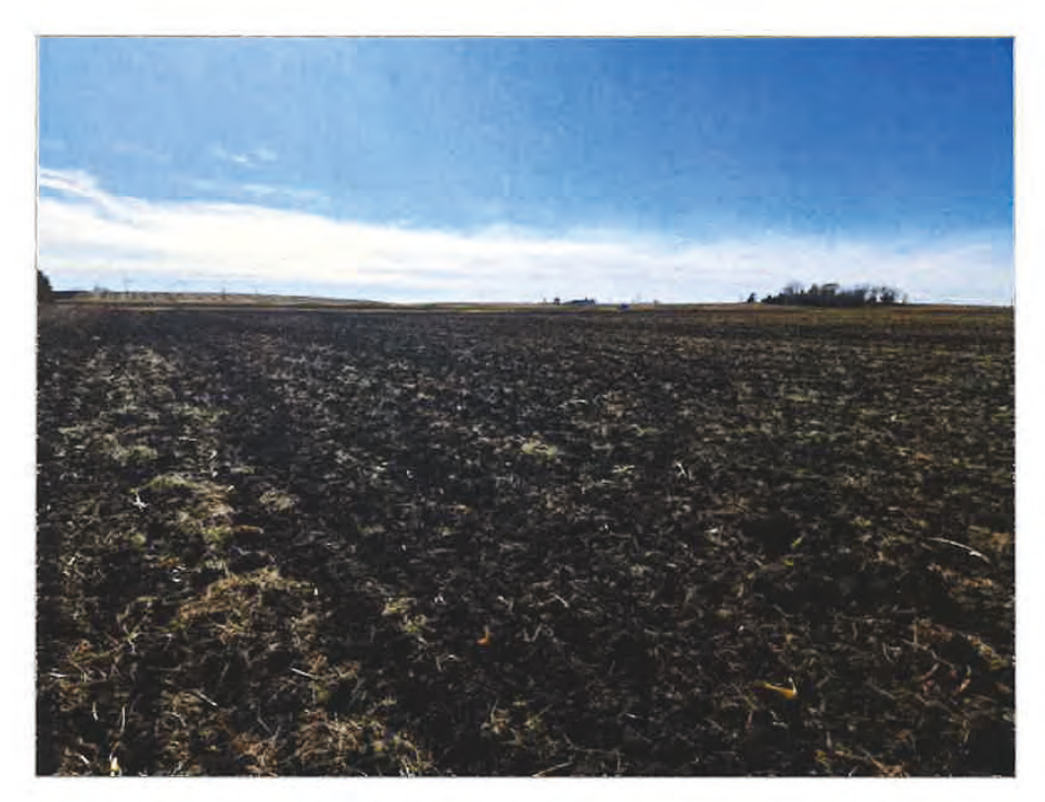
Figure 7: Overview of western substation on 325th Street, facing southeast.