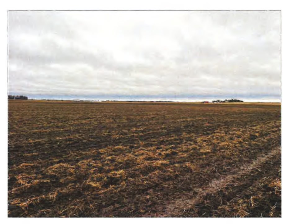
Figure 11: Overview of the west-central Project Area, facing west.