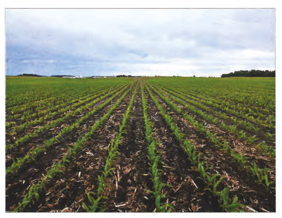
Figure 3: Overview of the southwest Project Area, facing east.