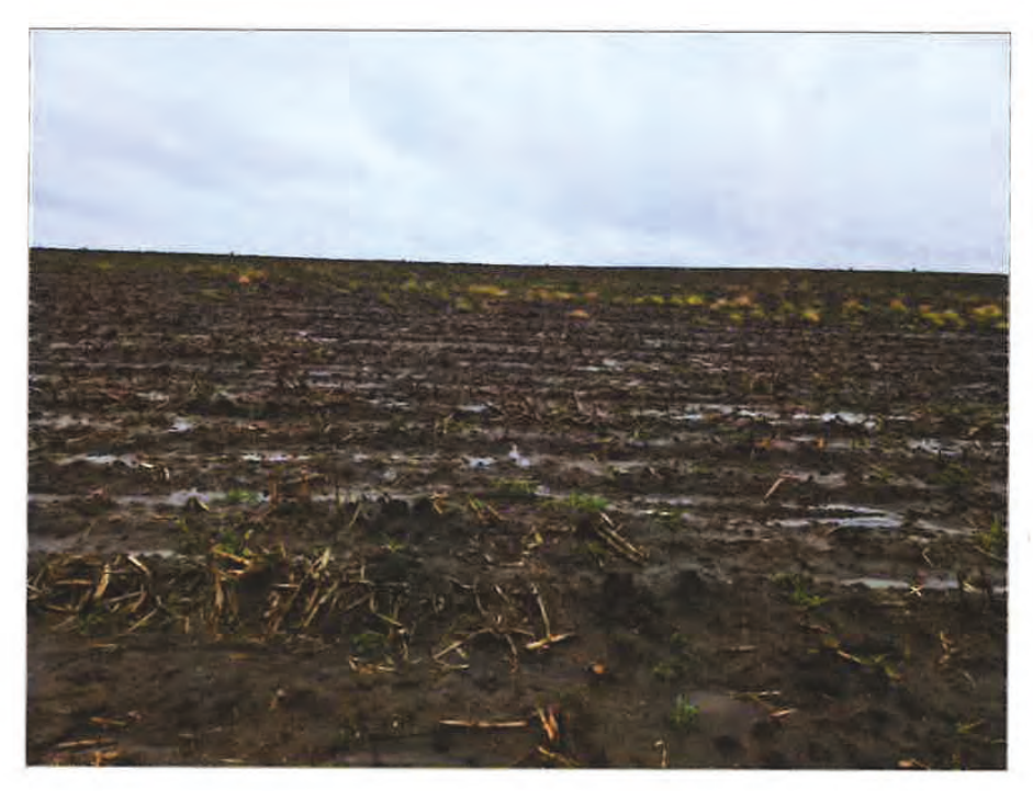
Figure 6: Overview of the north Project Area, facing north.