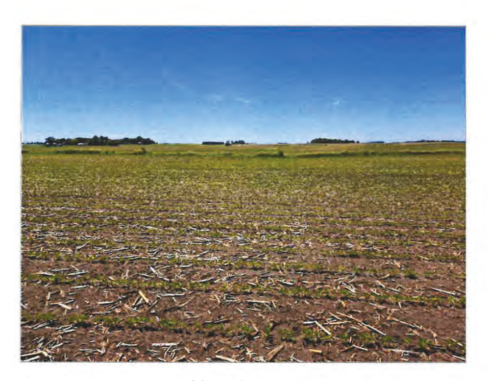
Figure 1: Overview of the northeast Project Area, facing west.