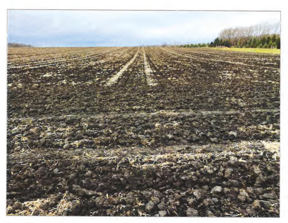
Figure 9: Overview of the south-central Project Area, facing west.