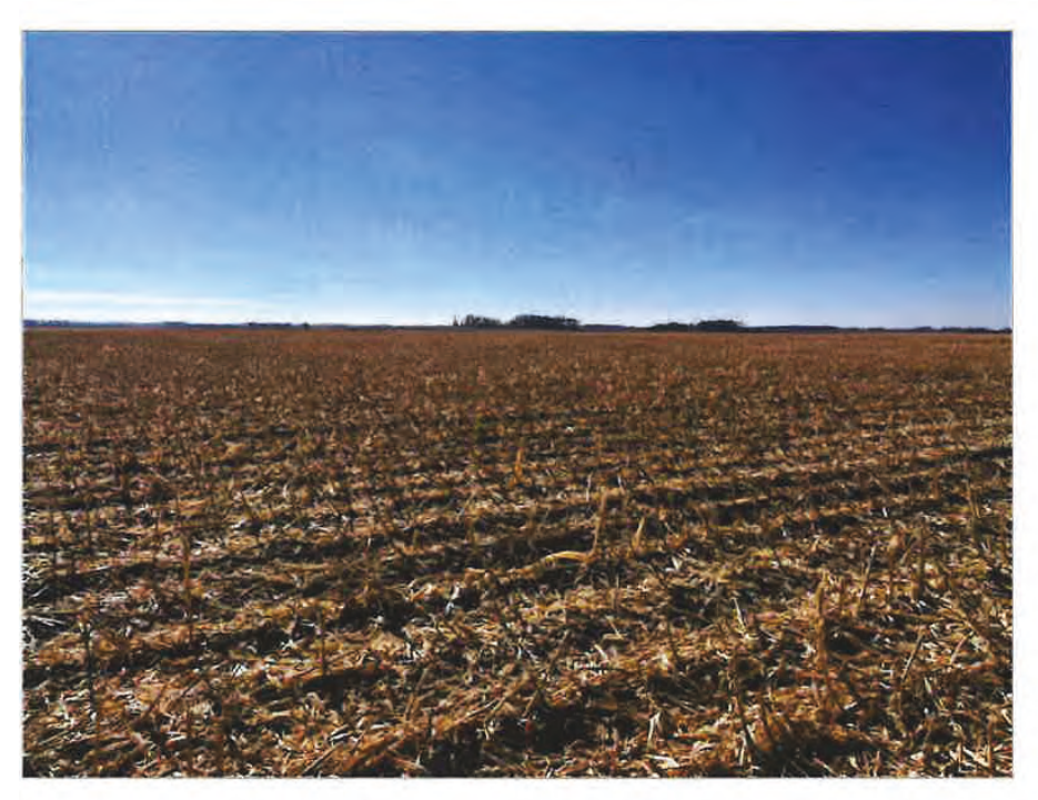
Figure 4: Overview of the southwest Project Area, facing east.