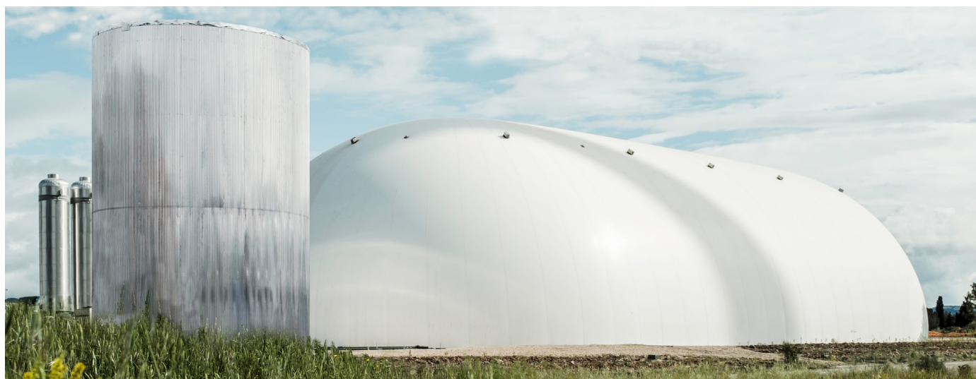
Energy Dome's CO 2 battery located in Sardinia, Italy.

The town of Pacific is an ideal location for an energy storage system due to the availability of existing electric grid infrastructure. The project, part of a multiphase site redevelopment effort, will increase energy reliability and resilience while delivering incredible value to customers. Pending approval, we expect the energy storage system to be operational by the end of 2026.