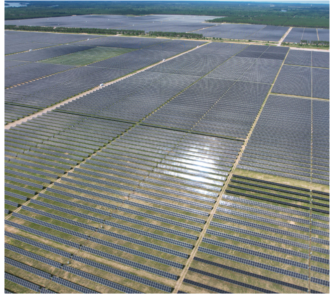
Completed Wood County Solar Project