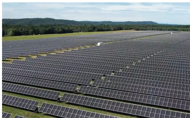
The final look of a solar project once complete (Bear Creek Solar Project, Richland County, WI).