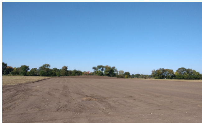
Crews have begun grading activities at the Albany Solar Project.

Sign up to receive our updates via email. They're better for the environment than print newsletters because they reduce paper waste and carbon emissions. Plus, you'll get updates faster! Contact solar@alliantenergy.com to request newsletter e-delivery.