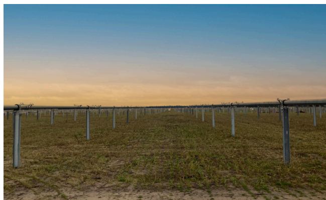
Piles and racking fully installed and await solar panels (Wood County Solar Project, Wood County, WI).