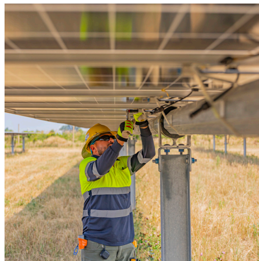
Workers completed panel installation and wiring in late 2023